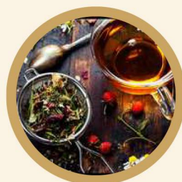
Black Orthodox Tea